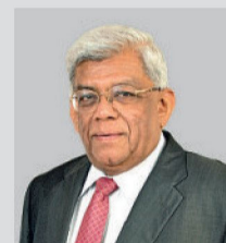
Deepak Parekh Board Member HDFC Life & HDFC AMC